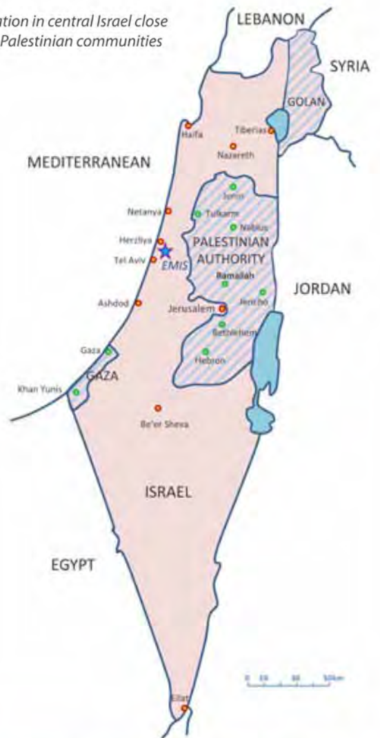
The EMIS location in central Israel close to Israeli and Palestinian communities

EMIS being established in Israel will offer future regional and international leaders a life-changing experience