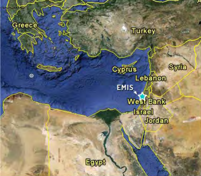
The EMIS location at the heart of the Eastern Mediterranean region

EMIS will dedicate itself to making education an active force to unite people, nations and cultures for peace and a sustainable future in the Middle East. The EMIS student body will comprise of 20% Israeli, 20% Arab and Muslim from the region and 60% international students making this a regional and an international experience that will empower young leadership in this region and worldwide.