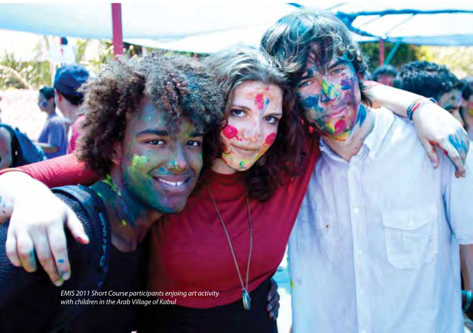
EMIS 2011 Short Course participants enjoying art activity with children in the Arab Village of Kabul

The Eastern Mediterranean International School is being established in Israel and the Middle East, a region that has both much to offer to and so much to gain from such a school.