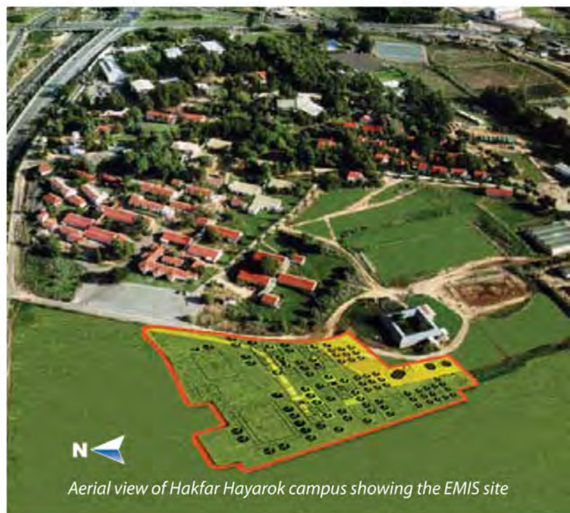
Aerial view of Hakfar Hayarok campus showing the EMIS site

We are identifying strong supporters for philanthropic partnerships.